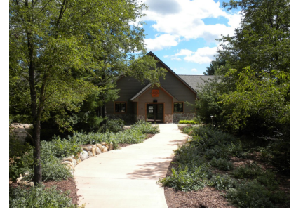
Boardman River Nature Center 1450 Cass Rd, Traverse City, MI 231-941-4263