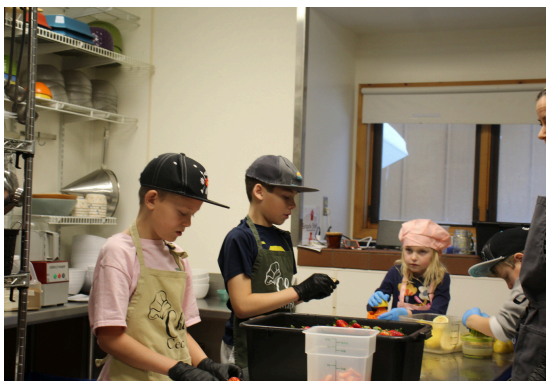
Kitchen class