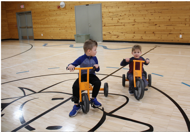
Kids riding bikes at gym