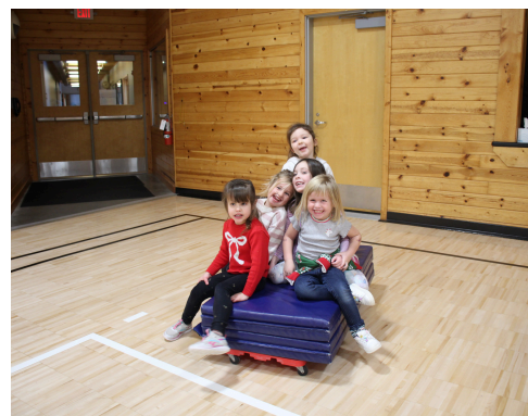
Kids at gym