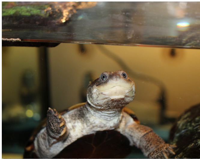
Lower EL Turtle | by Luke Smith