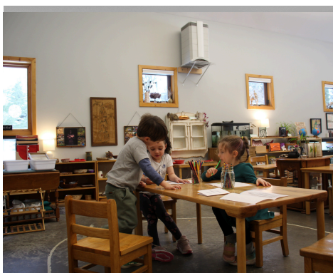
Primary class