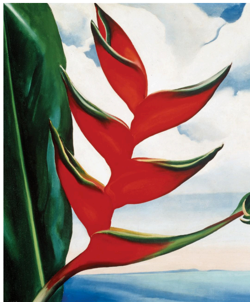
Heliconia, Crab's Claw Ginger, 1939.