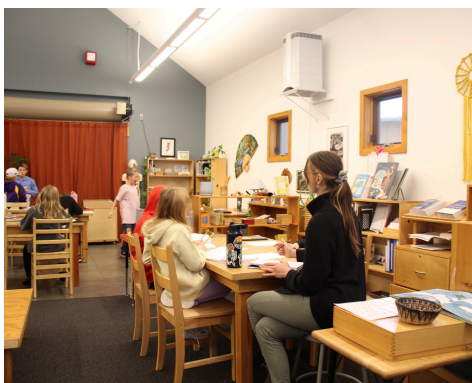
Cedar class